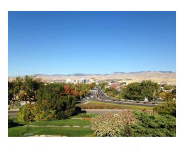
View of downtown Boise from the historic Depot.