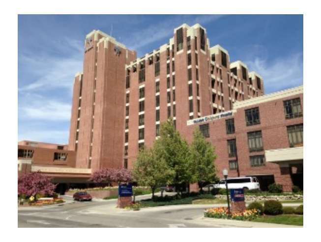
St. Luke's Health System Regional Medical Center, downtown, Boise.